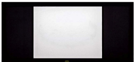
TAM2. ASPECT RATIO 1.33 (4/3)

Imaging is known as optimum when the projected image is exactly bordered by matt black edges, which provide a significant contrast enhancement together with a real focus on the image.